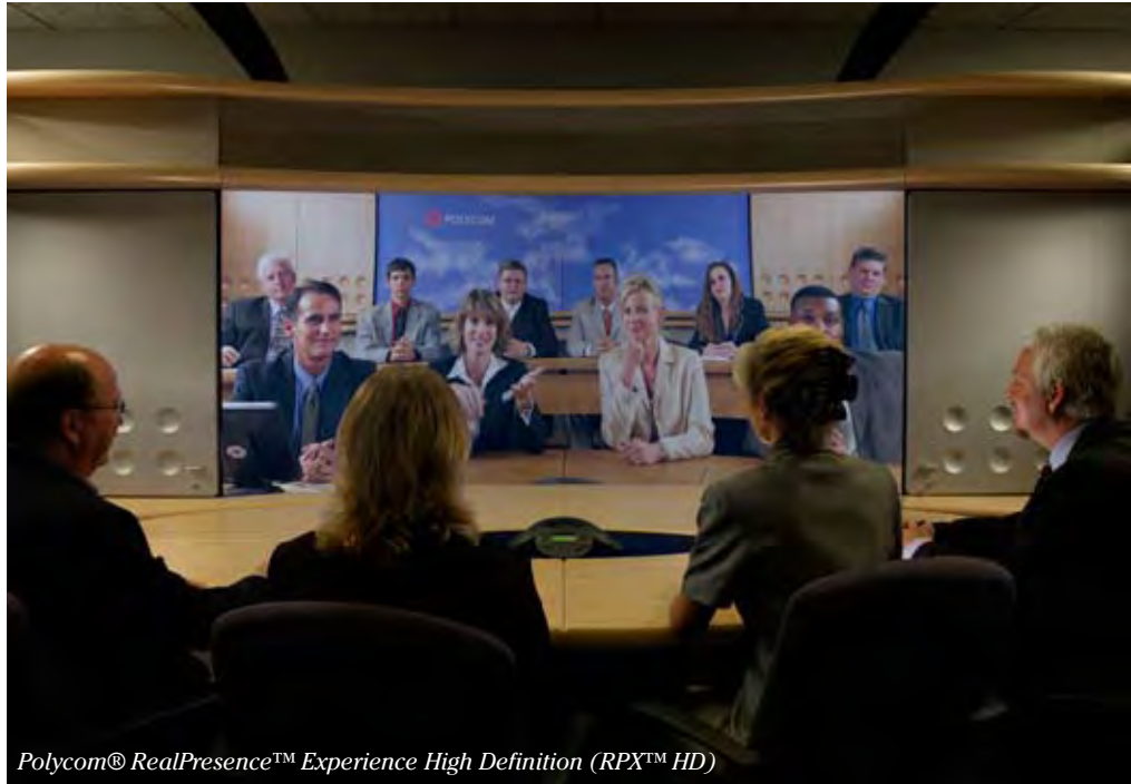
Polycom® RealPresence™ Experience High Definition (RPX™ HD)

Alain thank you very much for these valuable insights.