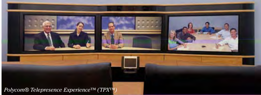
Polycom® Telepresence Experience™ (TPX™)

The all inclusive immersive telepresence environments featuring a new level of video solution for customers who demand the very best in quality